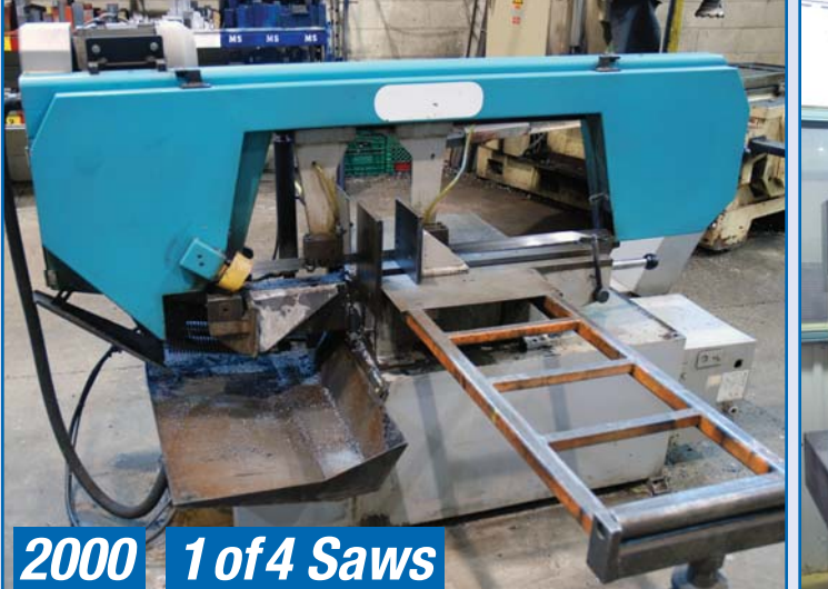
BOMAR STG-320GM HORIZONTAL BANDSAW