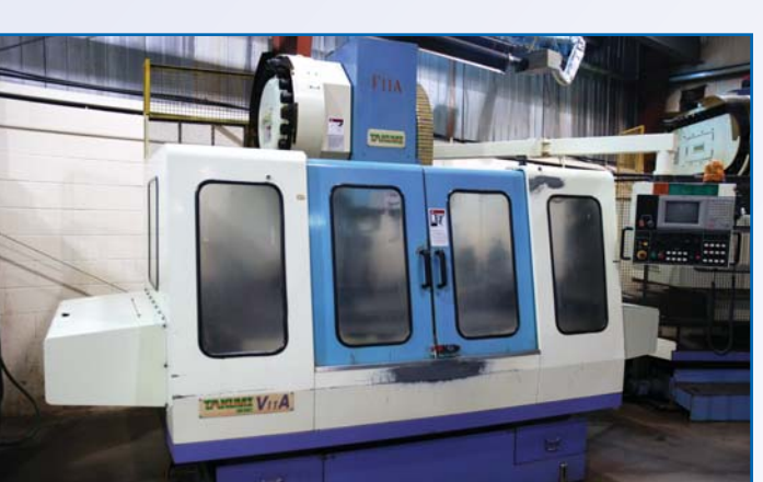
TAKUMI CNC VERTICAL MACHINING CENTER, MODEL V11A