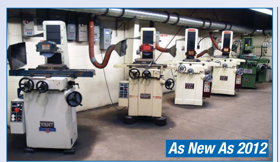
VIEW OF 6 KENT & YOUIL SURFACE GRINDERS