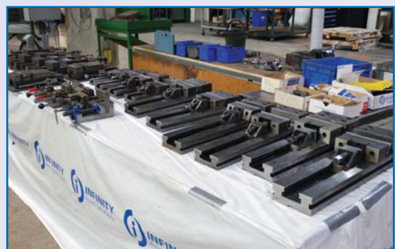
PARTIAL VIEW OF PRECISION VISES