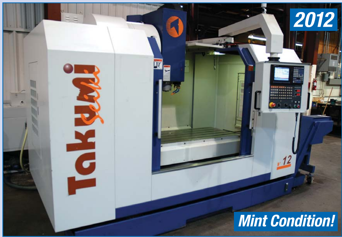
TAKUMI CNC VERTICAL MACHINING CENTER, MODEL V12