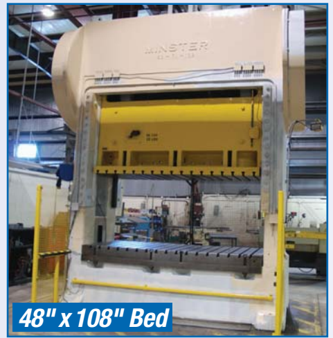
MINSTER 50 - 7-1/2 -08 PRESS