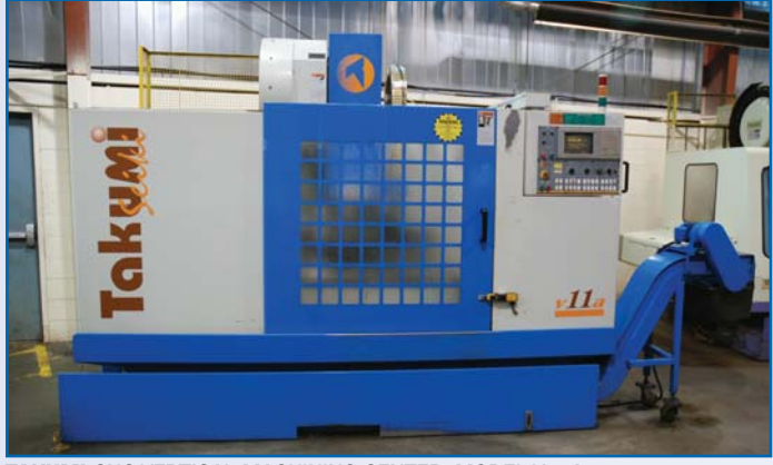
TAKUMI CNC VERTICAL MACHINING CENTER, MODEL V11A