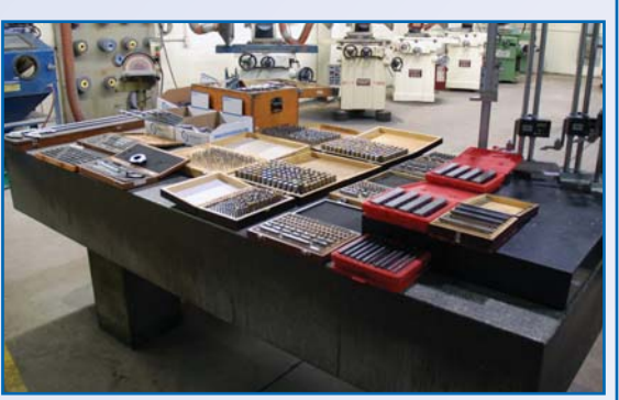
PARTIAL VIEW OF ASSORTED PRECISION INSPECTION