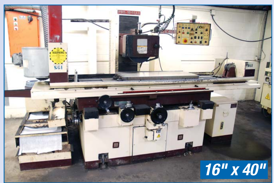
CHEVALIER FSG1640AD 16"X40" HYDRAULIC SURFACE GRINDER