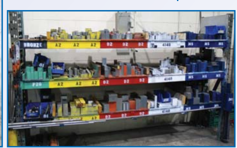
PARTIAL VIEW OF ASSORTED TOOL STEEL