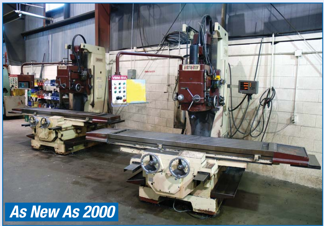
RASKIN 550 TON PRESS

(3) FIRST LC185VS, 10"x50", Heidenhain 2 Axis DR0, 60-4,500 RPM, 3 HP, 575V, sn 20904996 (1995), 70703101 (1997), 20904992 (2003)